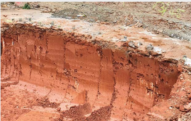
The Ischebeck TITAN micropiles were installed to form a contiguous bored cast-in-place pile wall.