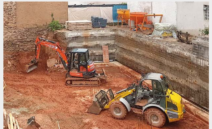
The first row of TITAN micropile anchors, with end plates already fitted.