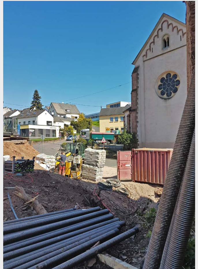
The excavation next to the Church of St. Clement.