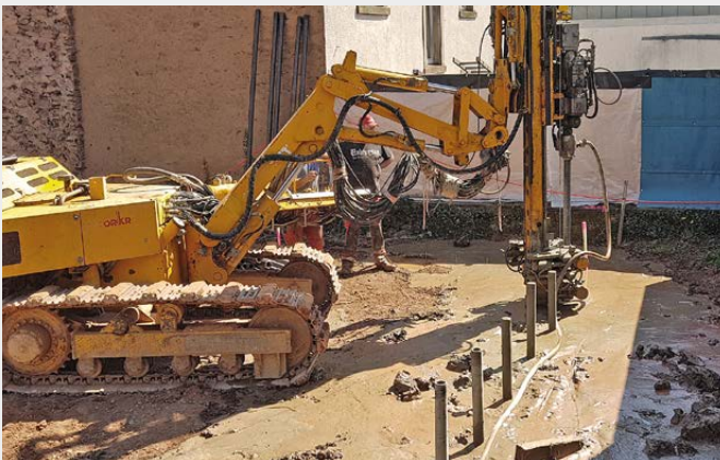
Self-drilling installation of micropiles on a confined site with a small drilling rig.